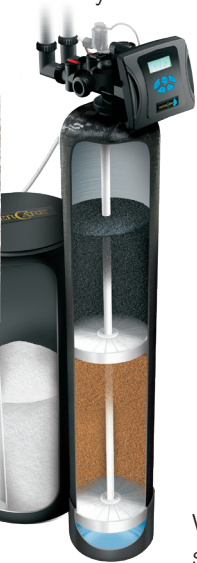
Split tank R/C model available

CareSoft softeners are designed to be flexible. With highly advanced control systems and eco-friendly features, these softeners offer amazing efficiencies to keep your home running smoothly. Customize your system from one of our options below: