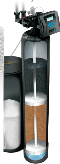
Split tank R/C model available

CareSoft softeners are designed to be flexible. With highly advanced control systems and eco-friendly features, these softeners offer amazing efficiencies to keep your home running smoothly. Customize your system from one of our options below: